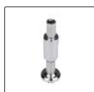
small sample fixture (optional)