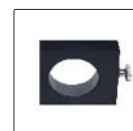
film test clamp (optional)