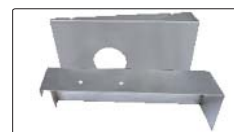
protective plate (optional)