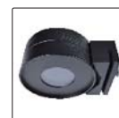
fiber test holder (optional)