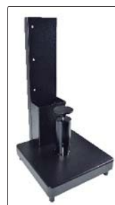
vertical stand (optional)