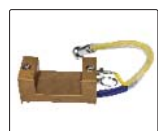
heated transmission clamp (optional)