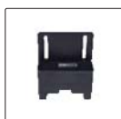
cuvette support (optional)